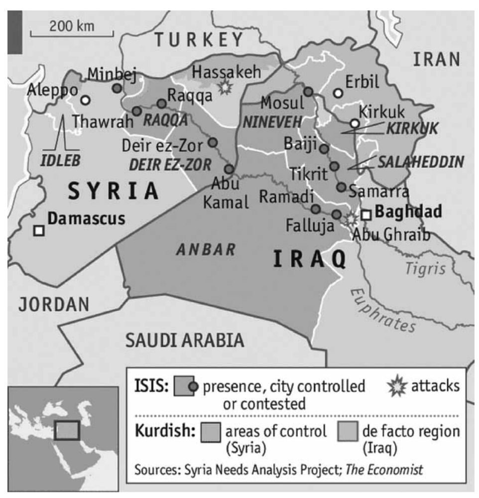
ISIS-controlled/contested areas and other city areas currently under attack as of June 2014.

In the context of improving American-Iranian relations, Washington needs to convince its Gulf allies that it still seeks to moderate Iranian aspirations. President Obama's March 2014 trip to Saudi Arabia was a first step. Such reassurance might require a period of increased U.S. military support and a defined U.S. presence (such as the maintenance of bases in the smaller Gulf States and of military and intelligence cooperation with the GCC states). Riyadh would be willing to explore a reduction of tensions with Tehran if the Saudis were more confident of their American ally.